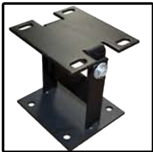
Steel Swing Bracket

Buy locally for the best service & support.