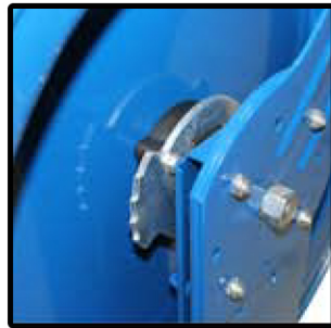
Two Stage Ratchet