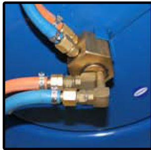
Solid Brass Connector Block